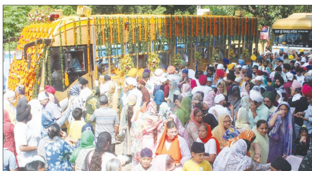
committee members, offered a handkerchief with reverence to the Guru Granth Sahib seated