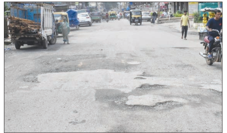
Near Chepapul in Mango