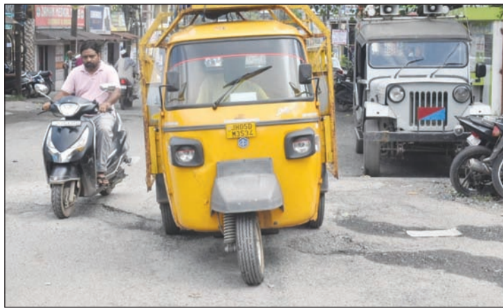
In front of Azadnagar police station, Mango