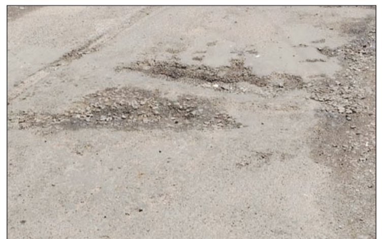
Thakur Bari Road, Sakchi