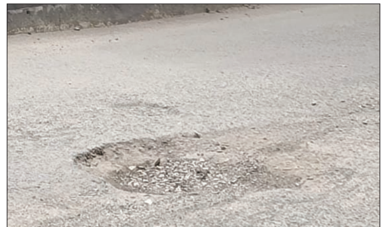
Near Gandhi Ghat in Sakchi