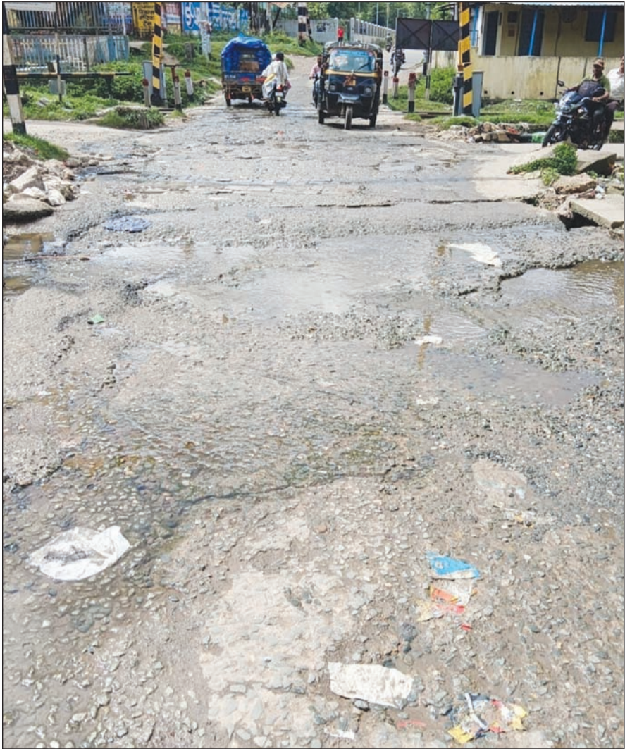
Makdampur Rly Crossing at Parsudih