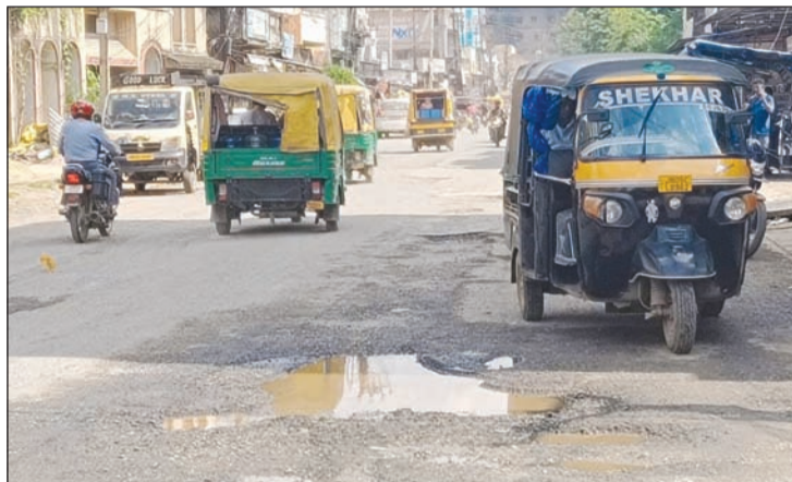
Old Purliya Road Mango