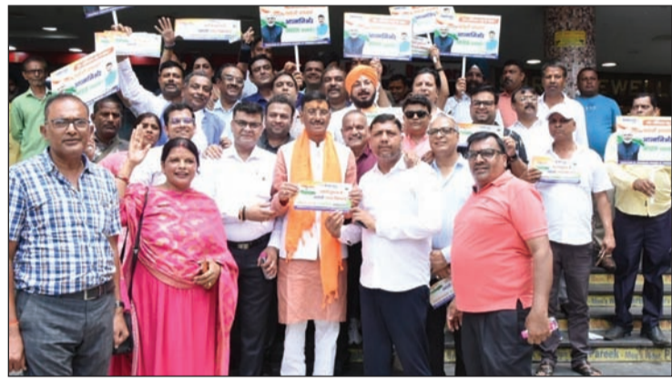
extended up to Harmu Road.