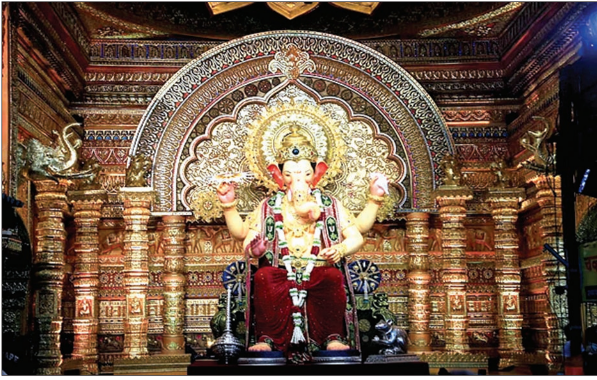
Massive crowd at Lalbaugcha Raja in Mumbai, devotees say 'feels like heaven'