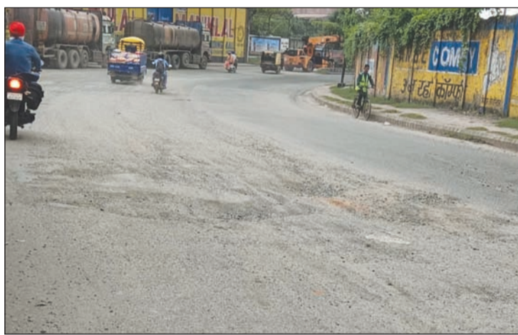
Kalimati Road Between Sakchi and Burmamines