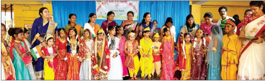
Mail News Service

Seraikela, Aug 17: The premises of Saraswati Shishu Mandir High School in Seraikela reverberated with patriotic spirit as the institution celebrated the