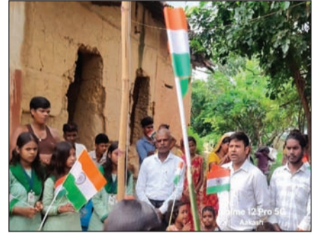
Mail News Service

Seraikela, Aug 17: The heartland village of Kendmundi in Rajnagar Block celebrated the 79th Independence Day with great enthusiasm at Rajendra Chowk. The programme was organized by local residents, creating an