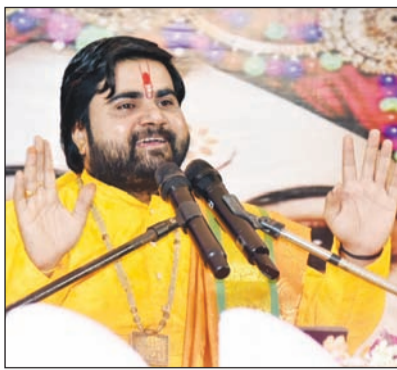
Govardhan Maharaj. Enraged, Indra caused torrential rains for seven days and nights, but Krishna lifted the Govardhan

He also recounted the episode of Govardhan Puja, highlighting how Lord Krishna encouraged the people of Vraj to stop worshipping Indra and instead offer prayers to Shri