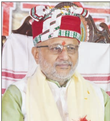
The decision to field Radhakrishnan, a seasoned politician with long-standing ties to the Rashtriya Swayamsevak Sangh (RSS), is being viewed as a strategic outreach to Tamil Nadu, where Assembly elections are due next

New Delhi, Aug 17 (IANS) The BJP on Sunday announced Maharashtra Governor Chandrapuram Ponnuswamy Radhakrishnan as the National Democratic Alliance's (NDA) candidate for the Vice-Presidential election, after a meeting of the party's parliamentary board chaired by Prime Minister Narendra Modi.