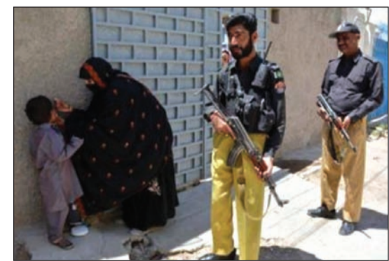
from official duties related to the country's polio eradication campaign, police said.

Islamabad, April 15 (IANS) Two health workers affiliated with Pakistan's anti-polio campaign were abducted by unidentified gunmen in the country's northwest Khyber Pakhtunkhwa province, police said Tuesday.