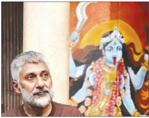
bow to Maa Kali and pray that peace and harmony are restored in Bengal. I urge the youth to rise with