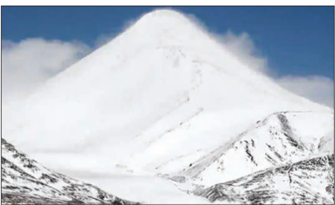
the missing climbers had bypassed the mandatory registration process. Later that same day, the rescue team located the bodies of all three climbers on the mountain.

Beijing, April 15 (IANS) Three climbers who earlier went missing had been confirmed dead on Yuzhu Peak, a popular mountaineering destination in northwest China's Qinghai Province, the Qinghai provincial sports authorities said on Tuesday.