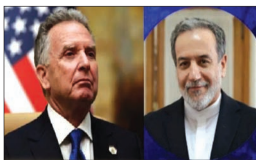
focused on Iran's nuclear programme and the potential removal of US sanctions.

In the first round of Muscat talks on Saturday, Iranian Foreign Minister Seyed Abbas Araghchi engaged in "indirect" discussions with US Special Envoy to the Middle East Steve Witkoff, facilitated by Omani Foreign Minister Sayyid Badr bin Hamad bin Hamood Albusaidi. These talks