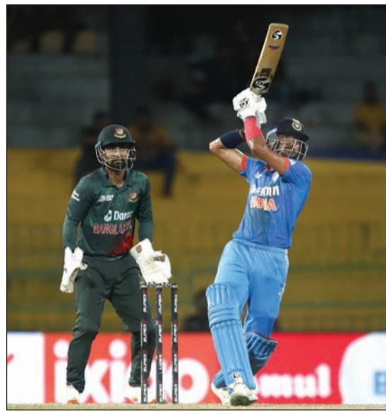
the first time Bangladesh will host India in a bilateral series at home. The most recent T20I series

This will mark India's first white-ball only tour of Bangladesh since 2014. Moreover, the T20I series will be