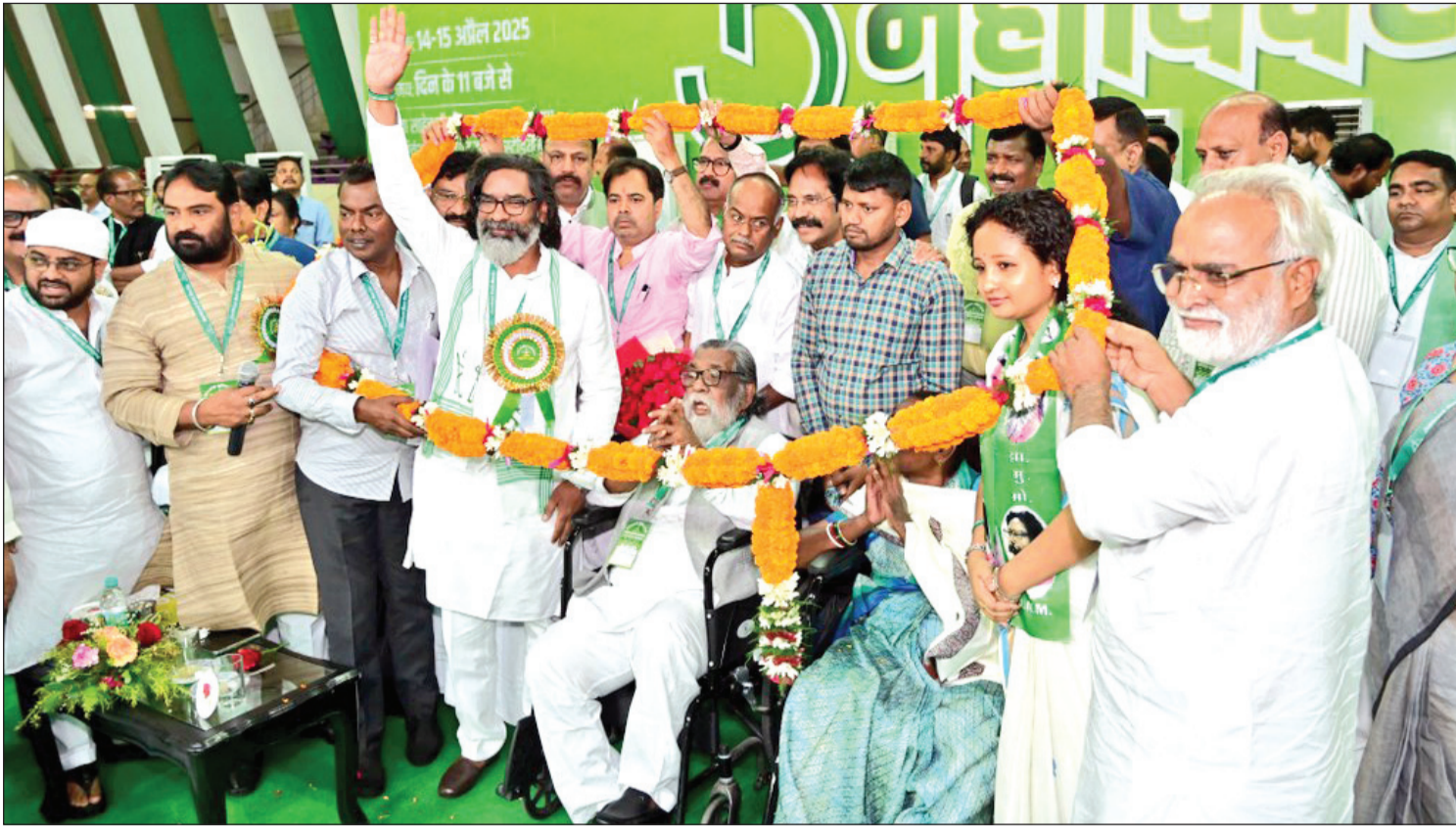
Jharkhand chief minister Hemant Soren, 49, was appointed national president of the ruling Jharkhand Mukti Morcha (JMM) on Tuesday after former chief minister Shibu Soren, 81, stepped down from the post to make space for his son. Shibu Soren, who has been JMM's national president since 1987, made the announcement at the party's two-day national convention in Ranchi on Tuesday. He has been appointed as the party's founder patron.