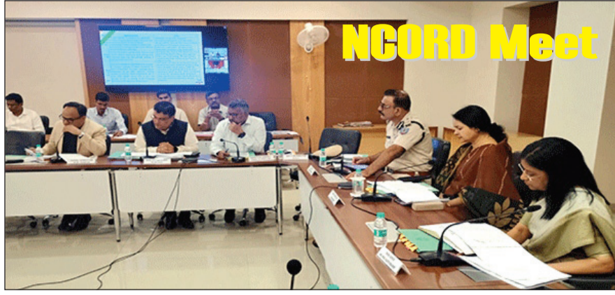
(NCB) are training state police officers on the provisions of the Narcotic Drugs and Psychotropic Substances (NDPS) Act at the Research and Training Institute in Hotwar, Ranchi.

To bolster control over illegal drug trade, continuous training is being provided to law enforcement officials. Officers from the Narcotics Control Bureau