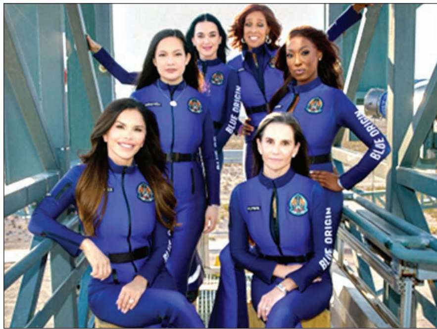
Blue Origin's spacecraft since it began the civilian programme in 2021.

flight brought the passengers beyond the Karman line -- the internationally recognized boundary of space. The vessel lifted off from West Texas at 9:31 am ET and traveled to the edge of space, where the passengers experienced a brief period of weightlessness before returning to Earth in a flight lasting around 11 minutes, according to a live broadcast by Blue Origin. The women went to space aboard Blue Origin's New Shepard spacecraft, which can carry up to six passengers on a short journey beyond the Earth's atmosphere. Including Perry and her crew, as many as 58 people have travelled to space aboard