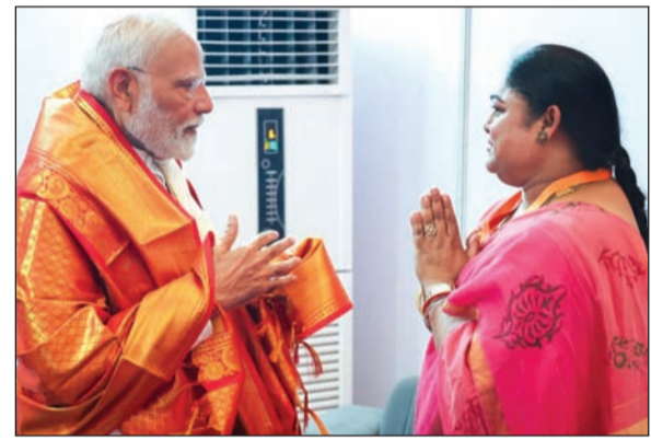
invited her to meet him. "I have an academy in Yamunanagar, and I had requested the Prime Minister to visit. His (PM Modi's) schedule was very

Speaking to IANS, the 49-year-old stated that she had requested PM Modi to visit her academy; however, due to his busy schedule, he instead