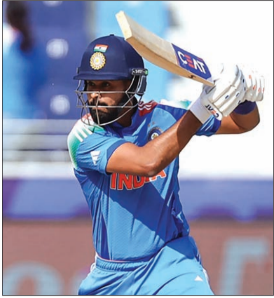
I will cherish forever. "Being able to contribute to

"I'm truly honoured to be named the ICC Men's Player of the Month for March. This recognition is incredibly special, especially in a month where we lifted the ICC Champions Trophy - a moment