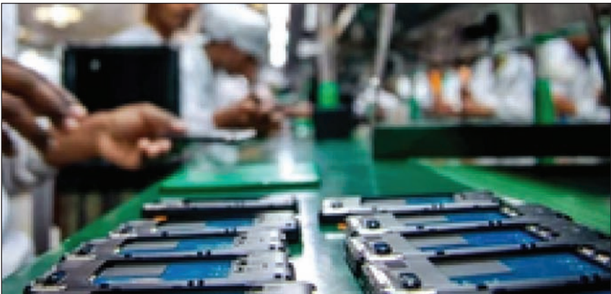
majority stake in Pegatron Technology India Private Limited fits into Tata Electronics' strategy of growing our manufacturing footprint," said Dr

Mumbai, Jan 24 (IANS) In a fillip to the government's 'Make in India' initiative, Tata Electronics on Friday acquired a controlling 60 per cent stake in Pegatron Technology India, which produces Apple products like iPhones. The acquisition boosts the company's position as a major player in India's electronics manufacturing industry. This follows Tata Electronics' acquisition of Taiwanese electronics