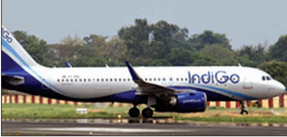
The decline in profits was largely due to a 20 per cent rise in its expenses, which reached Rs 20,466 crore, compared to Rs 17,064 crore in the same

Mumbai, Jan 24 (IANS) InterGlobe Aviation, the parent company of IndiGo, on Friday reported a 18.6 per cent drop in its consolidated net profit for the third quarter (Q3) of the financial year 2024-25 (FY25). The company posted a profit of Rs 2,448.8 crore in Q3, down from Rs 2,998.1 crore during the same period last year.