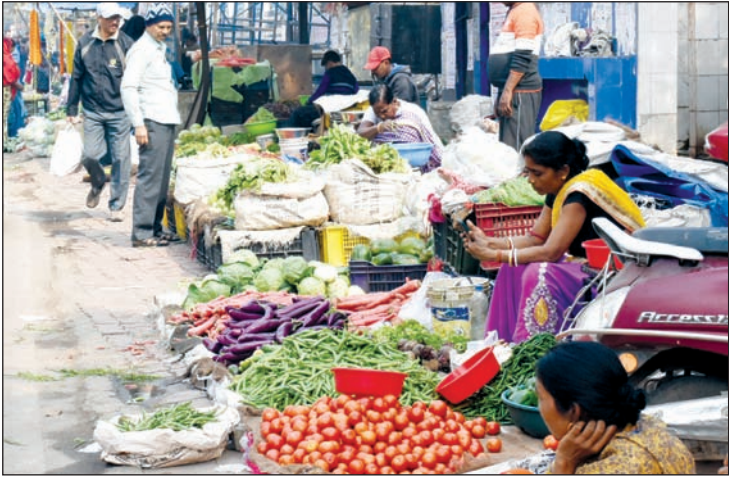
Farmers selling vegetables by the roadside in Mango, while the haat market built by the administration remains unused and littered with dirt.