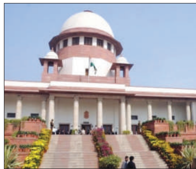
action akin to census".

The fresh affidavit filed by the Office of the Registrar General in the Union Home Ministry retracted the paragraph saying that "no other body under the Constitution or otherwise (except Centre) is entitled to conduct the exercise of either Census or any