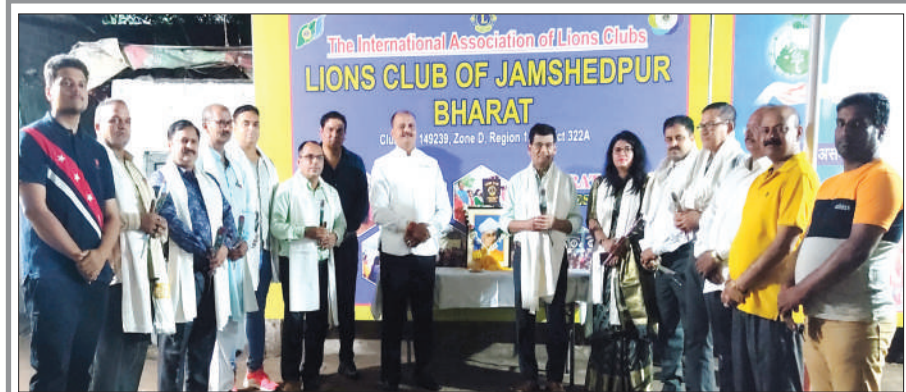
Teachers were honoured on the occasion of Teachers' Day by Lions Club of Jamshedpur Bharat at a function organized on Tuesday, September 5.

The Deputy Commissioner emphasized the district administration's commitment to resolving issues promptly and enabling local residents to avail themselves of government schemes. This grievance redressal program exemplifies the administration's dedication to fostering community engagement and ensuring the efficient resolution of public concerns. (W.pb.)