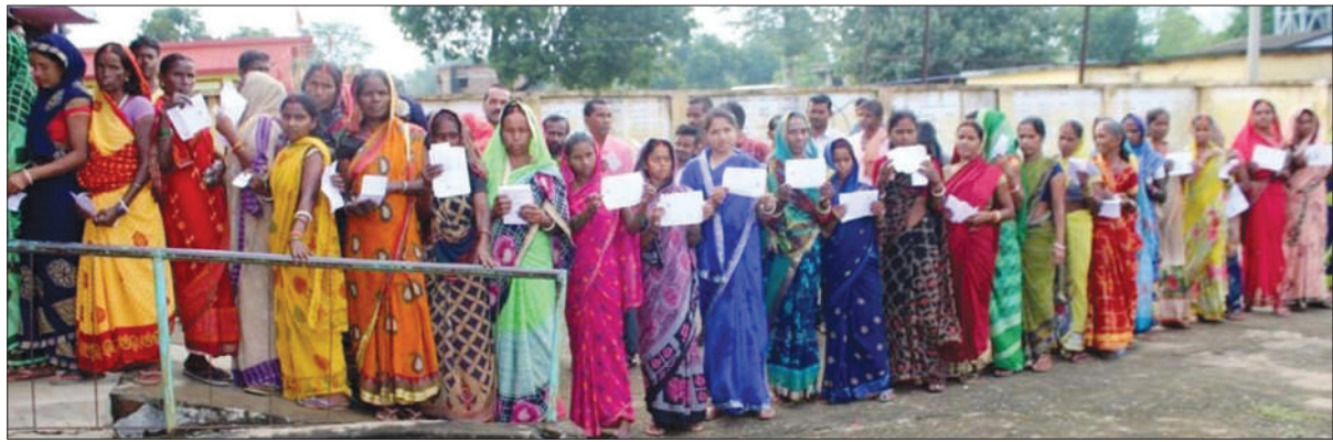
Despite rains, voters queued up at a polling booth for the Dumri by-elections in Giridih on Tuesday, September 5.