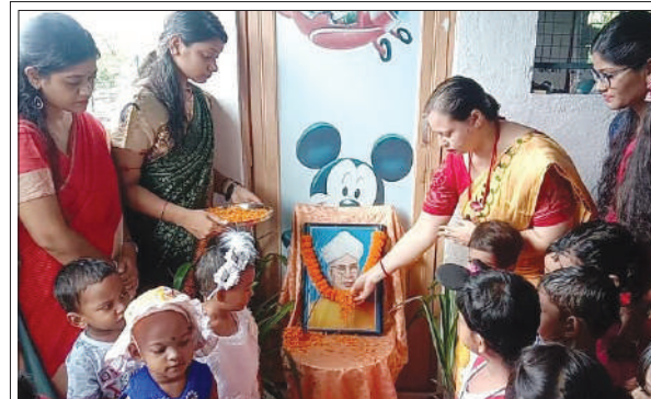
Teachers' Day was celebrated on Tuesday at Chaibasa's Sai Aman Play School in Mahuri Bhavan at Sadar Bazar. The Principal and teachers offered floral tributes at the portrait of former President of India, Bharat Ratna Dr Sarvepalli Radhakrishnan. The students put up colourful cultural presentations while a competition was organized among the parents on the occasion.

heartwarming reminder of the profound impact that teachers have on society. It emphasized the importance of acknowledging their hard work and dedication, not just on this special day, but every day, as they continue to inspire and shape the leaders and innovators of tomorrow. (W.pb)