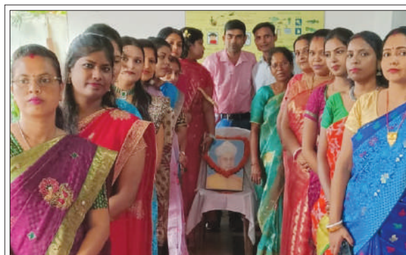
Teachers' Day was celebrated with enthusiasm at JP School in Sankosai, Mango. The celebrations commenced with garlanding the statue of Dr Sarvepalli Radhakrishnan and offering floral tributes.

Jamshedpur isn't just a hub for industry but also for education, and Teachers' Day underscored the critical role teachers play in shaping the future of the