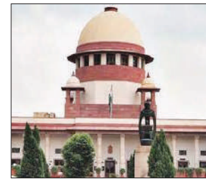
Kaul, Sanjiv Khanna, B.R. Gavai, and Surya Kant.

"We must end it with a vote of thanks to all the members of the bar. Thank you very much," said the bench, also comprising Justices Sanjay Kishan