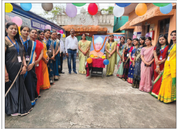
Teacher's Day was celebrated at Xavier Public School, Kitadih, with students honoring their teachers with presentations of songs, dances and speeches.