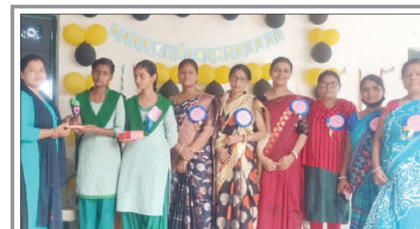
Teachers' Day was celebrated in Hindi Middle School, Haldipokhar in Potka on Tuesday.