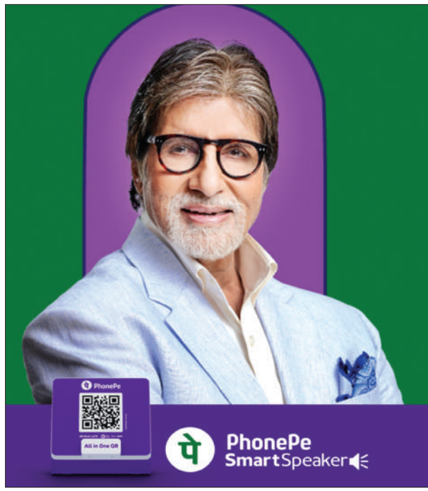
collaboration will further elevate the popularity of the PhonePe SmartSpeaker for merchants and customers

"Being a popular Indian app used by one in four Indians, we believe this