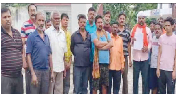
Mail News Service