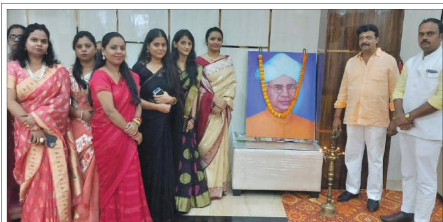
On the occasion of Teachers' Day, SS Academy in Baliguma paid tribute to the former President and Bharat Ratna, Dr Sarvepalli Radhakrishnan. The students presented a colourful cultural programme.

At Loyola School, a grand event was held at Fasy Auditorium where students paid tribute to their teachers through heartfelt