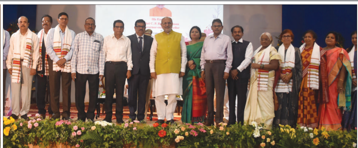
Jharkhand Governor CP Radhakrishnan offered tribute to Former President Dr Sarvepalli Radhakrishnan and felicitated teachers on the occasion of Teachers Day Celebrations organized at Dr Shyama Prasad Mukherjee University in Ranchi on Tuesday, September 5, 2023.