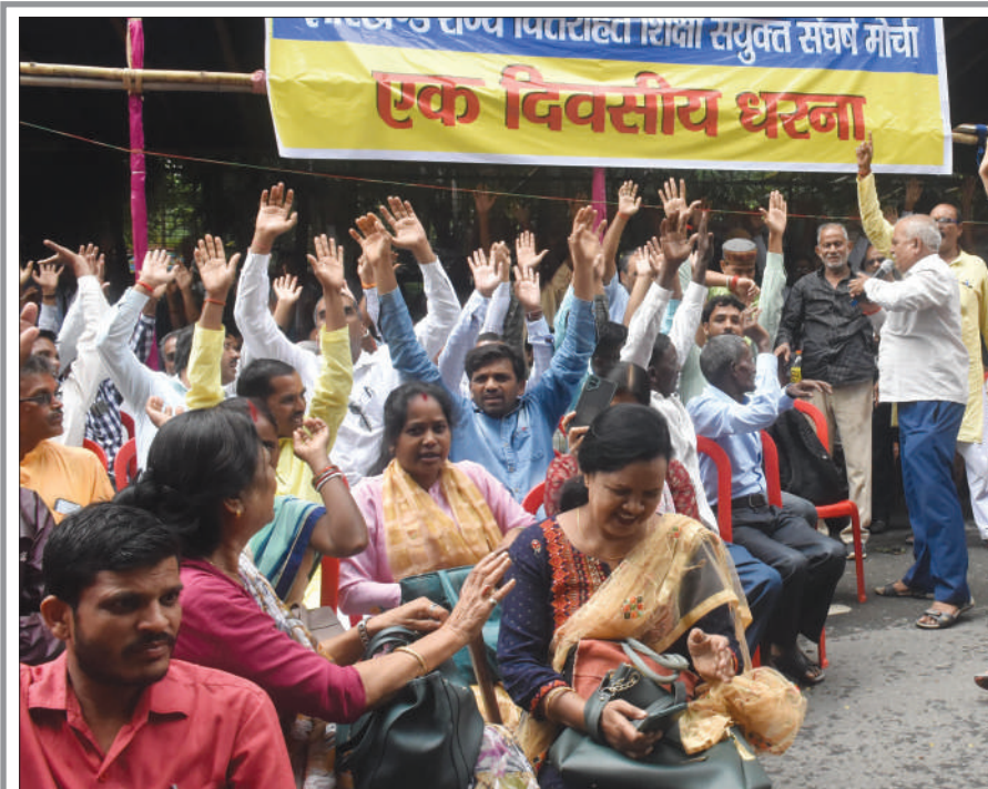
TET Passed assistant teachers, under their 'Bhikshatan Programme' (seeking alms), held a demonstration before the Governor House in Ranchi on Tuesday, September 5 and raised slogans in demand for payment of their pending salaries and permanent jobs.

Gamharia, Sept 05: In a devout celebration of Shri Krishna Janmashtami, the Gamharia Unit of the Jharkhand Kshatriya Sangh has orchestrated a grand religious event, the 24 Prahar Akhand Harikirtan. This sacred gathering, commencing on Wednesday, September 6, unfolds within the serene precincts of the Ghoda Baba temple complex in Gamharia. A harmonious convergence of Kirtan troupes from various regions, including Seraikela and Jamshedpur, has been arranged for this spiritual occasion. The resonant chants of Harikirtan will continue until the auspicious day of Thursday, September 7.