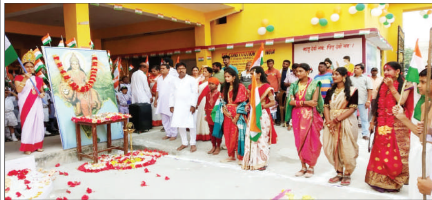
The 77th Independence Day was celebrated with great enthusiasm at Saraswati Shishu Mandir Higher Secondary School in Seraikela.