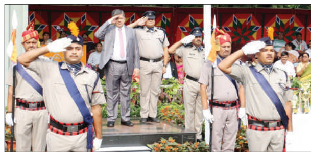
Mail News Service

Jamshedpur, August 16: On the occasion of 77th Independence Day, the main function of Tata Motors was organized at Sumant Mulgaonkar Stadium in Telco.