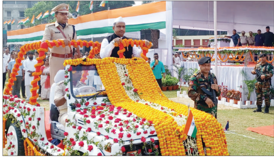
Mail News Service

East Singhbhum administration celebrates Independence Day at Gopal Maidan