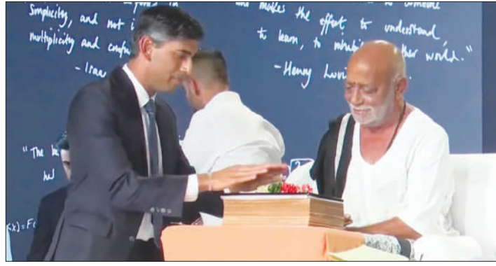
Sunak went on to talk about the

For me, faith is very personal. It guides me in every aspect of my life. Being Prime Minister is a great honour, but it is not an easy job. There are difficult decisions to make, hard choices to confront and our faith gives me courage, strength, and resilience to do the best that I can for our country," he added. He also said that his Hindu faith gives him the courage to do his best as the Prime Minister of Britain and guides him in every aspect of his life.