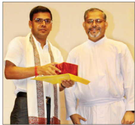
Mail News Service

Jamshedpur, August 16 : Everybody ought to have some rare inspiration to push ahead in their life. Getting moved or inspired by someone, who will assist you in achieving your objectives, has always been