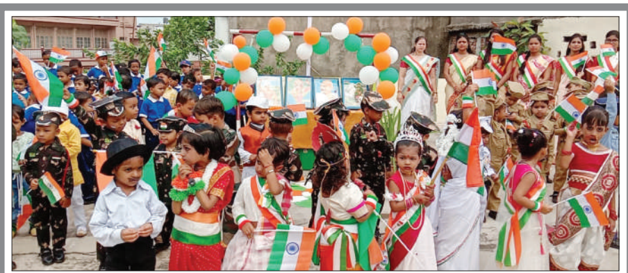
A Prabhat Pheri (Dawn March) and flag hoisting event was organized at Sai Aman Play School.