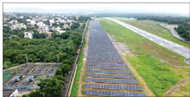
Mail News Service

Jamshedpur, Aug 16: A ground-mounted Solar Power Project of 2.0 MWp (Megawatt peak) capacity was commissioned in Tata Steel's Sonari Airport at Jamshedpur on Monday, August 14.