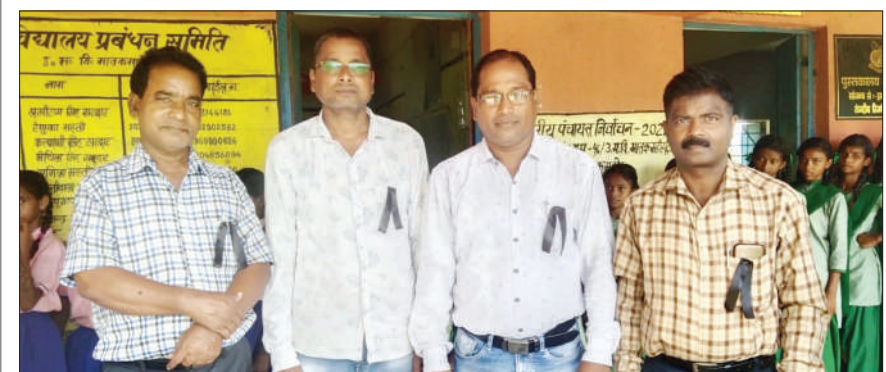
Assistant teachers in Saraikeela district protested against the appointment rules in their category and launched on a phased movement as a part of which the JTET passed teachers took classes wearing black badges.