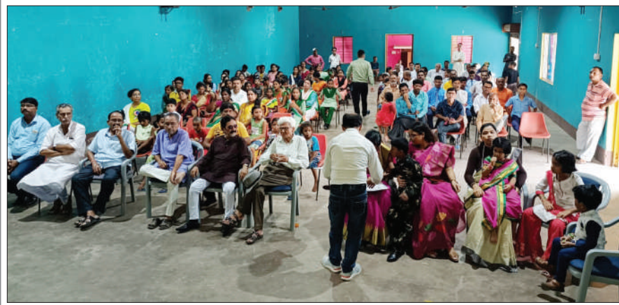
Utkalmani Adarsh Pathagar Saraikeela honored outstanding students of schools in the region on the occasion of Independence Day.