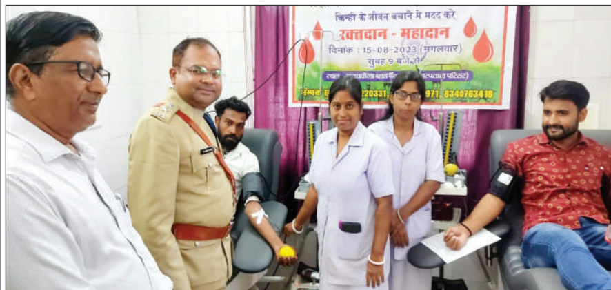
The youth segment under Saraikeela Nagar Panchayat organized a blood donation camp at Saraikeela Blood Bank on the occasion of Independence Day. A total of 53 units of blood were collected in the camp.