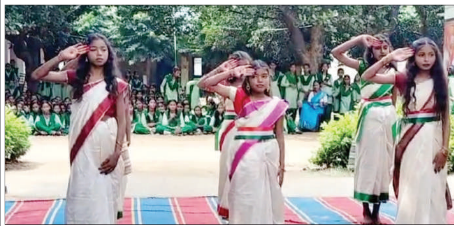
The 77th Independence Day was celebrated with great fanfare at Jamadoba Uch Vidyalaya in Kolabira.