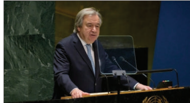
The Intergovernmental Panel on Climate Change

"You are the major economies -- but also the major emitters. And our world has a major climate challenge before us. Today's policies would make our world 2.8 degrees hotter by the end of the century. And this is a death sentence," said Guterres.