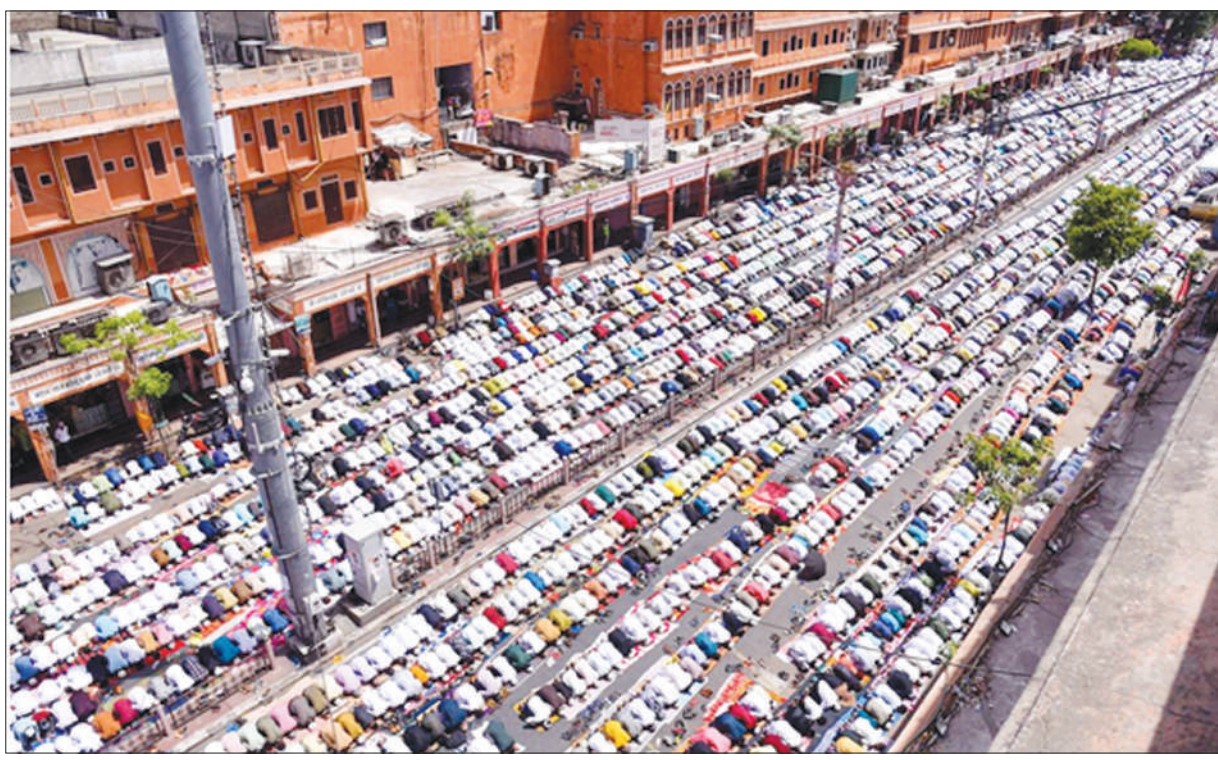
Muslim Devotees offering Namaz at Badi Chaupar and Johri Bazaar outside Jama Masjid in the Walled City on the occasion of Juma-tul-Vida (last Friday of Ramzan) in Jaipur on Friday, April 21, 2023.