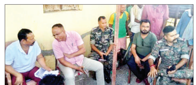
Mail News Service

Chaibasa, April 21 : The construction work of the medical college under construction in Ulijhari village located in Chaibasa block will now go on smoothly.